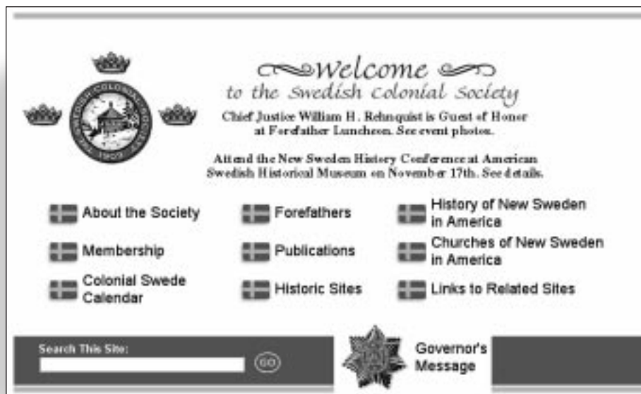
The home page at www.ColonialSwedes.org .