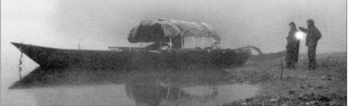
Like a modified church boat, the James River bateau is an authentic replica of an excavated river boat.

It is hoped that a replica might be constructed to memorialize the Swedish settlers who regularly crossed the Delaware to worship each Sunday in Wilmington. Any information is gladly received at 94 Sparks Avenue, Pennsville, NJ 08070, (856) 678-5511 or goaleasa@aol.com .