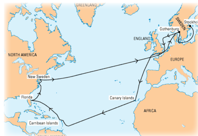
ROUTE TRAVELLED BY THE SWEDES.

New members are always welcome. No Swedish relatives or ancestry is required.