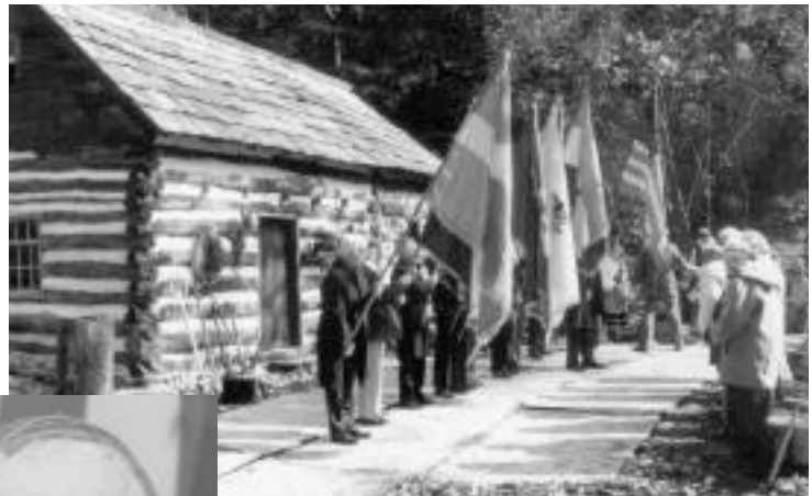
Lower Swedish Cabin dedication.