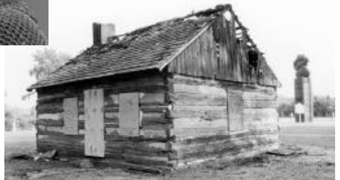
Stallcup log cabin at Ft. Christina Park damaged by fire.