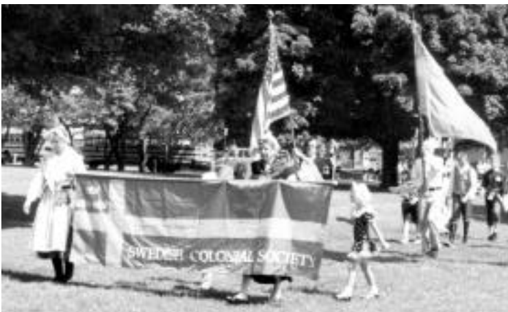
The Swedish Colonial Society on parade.