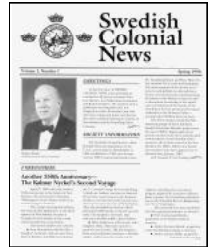
Volume 1, Number 1 - Spring 1990

Ninety-one years later we are still honoring those commitments.