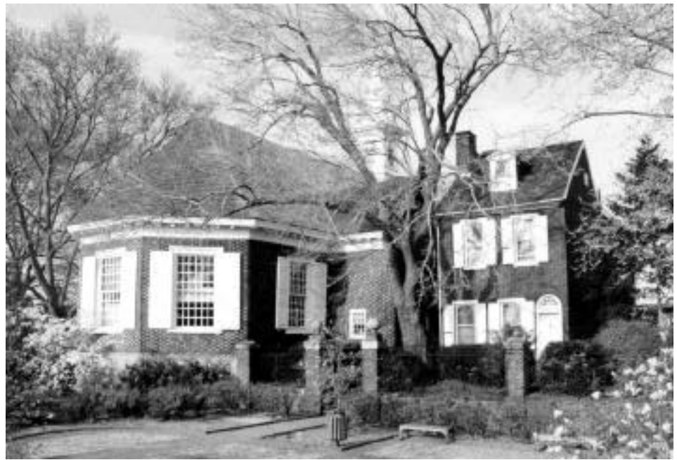
Gloria Dei (Old Swedes') Church and Rectory, Philadelphia, PA.