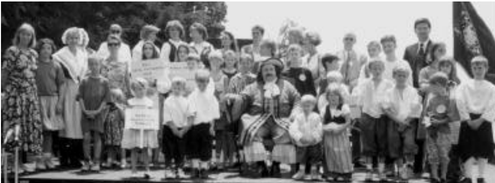
Children celebrate Governor Printz's arrival.